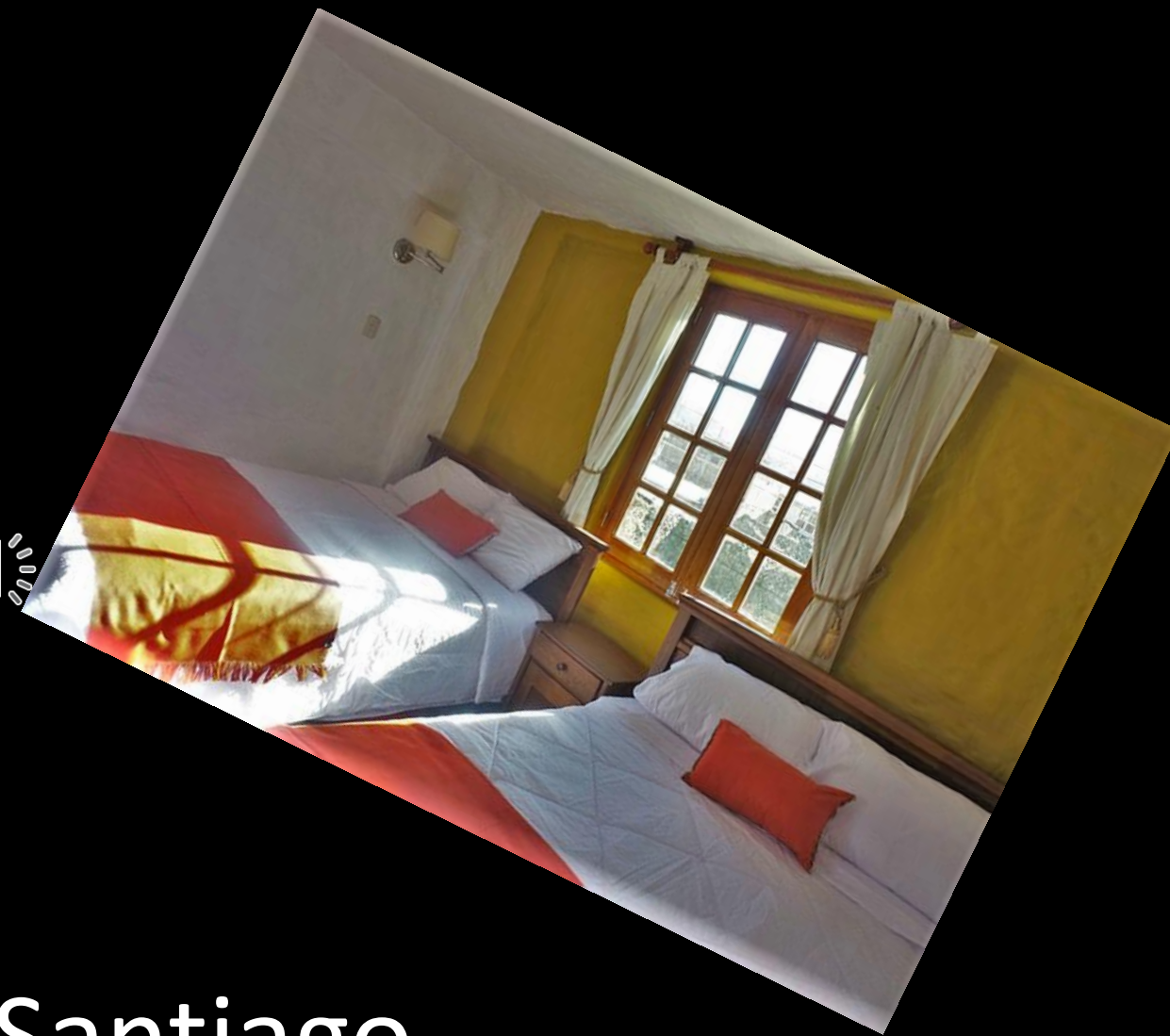
Casa de Santiago